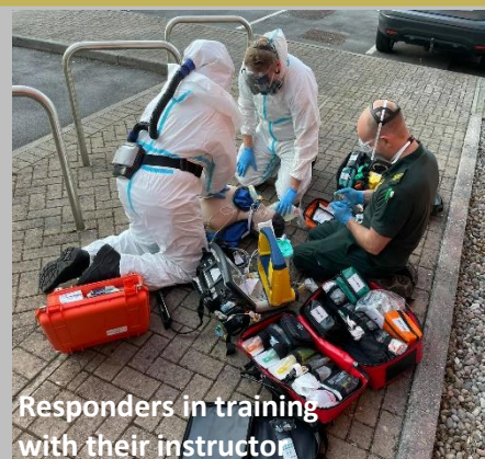
Responders in training with their instructor