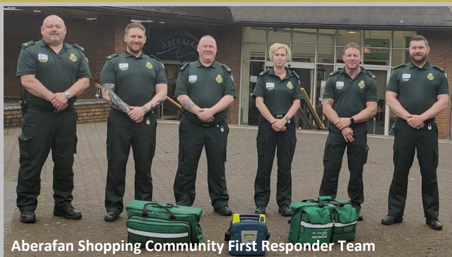
Aberafan Shopping Community First Responder Team

What I love most about being a CFR, is being able to make a difference in people’s lives when they need it most, whether that be from a life-threatening condition, or simply lifting someone back up off the floor after a fall. It’s definitely a role I can highly recommend.”