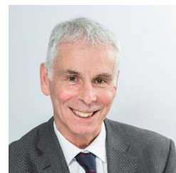
Martin Woodford Chair