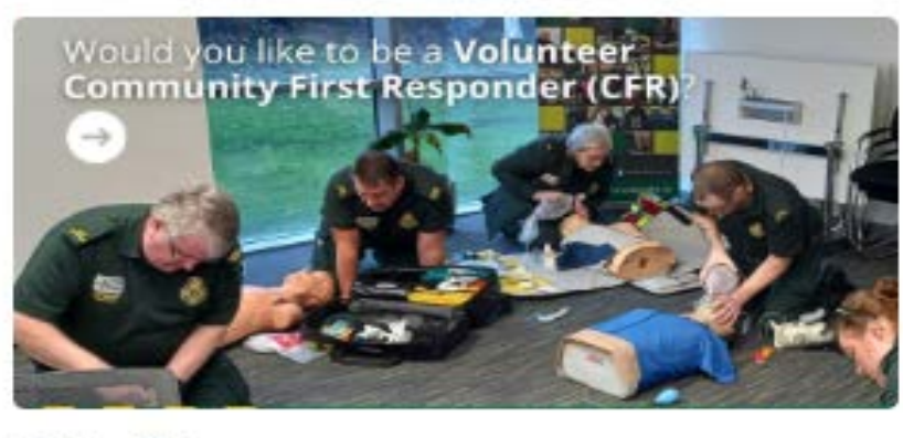
£7 18 ♥2

Applications close 23 April 2023. pic.twitter.com/lpaRpUCXeT